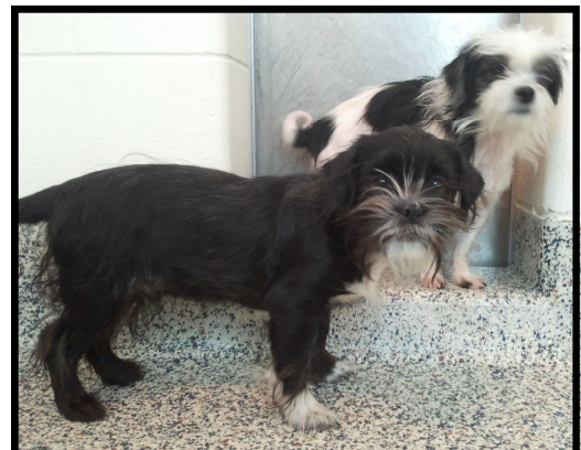
Bam Bam and Suzie fully recovered

Bam Bam and Suzie, two five-month-old terrier mix puppies, were brought to Foothills Animal Shelter by a dedicated Lakewood Animal Control Officer one cold morning in September. The two pups were missing most of their fur and were very scared. Bam Bam and Suzie were brought directly to FAS's Health Care Unit for a full assessment. After a few tests, the Health Care Team found that both puppies had a very contagious skin disease called mange. The two puppies underwent treatment for their illness, and with help from the Shelter's dedicated staff and volunteers, Bam Bam and