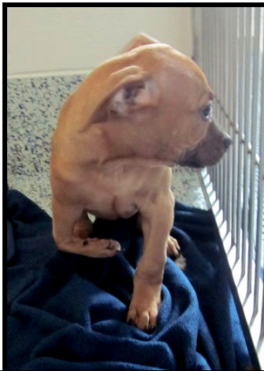
Bethany before surgery