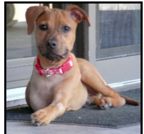
Bethany fully recovered in her new home