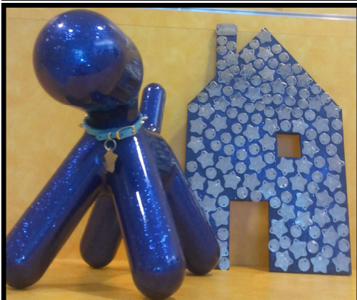
FoundHound hanging out in the Shelter's main lobby.