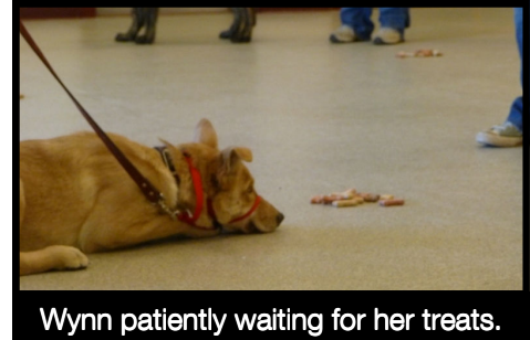
Wynn patiently waiting for her treats.