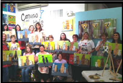
The amazingly talented and generous group of women from Bank of America and Merrill Lynch's Women's Exchange.

The Bank of America/Merrill Lynch Women's Exchange, a group of associates dedicated to Connect, Collaborate, and Inspire, hosted an evening full of creativity and giving in support of Foothills Animal Foundation. The group, which has been collecting monetary and wish-list donations for Foothills Animal Foundation at their Metro Denver offices over the past month, gathered at Canvas and Cocktails in Cherry Creek to paint Well Behaved Dogs . We are so grateful to all who put on their painting smocks and generously gave in support of FAF!